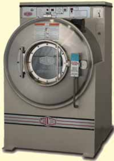
30015 C4E TripleLoader 40 lb. (18 kg)