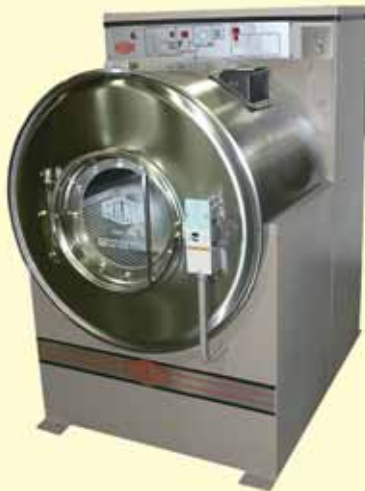
30022 C4E MultiLoader 60 lb. (27 kg)