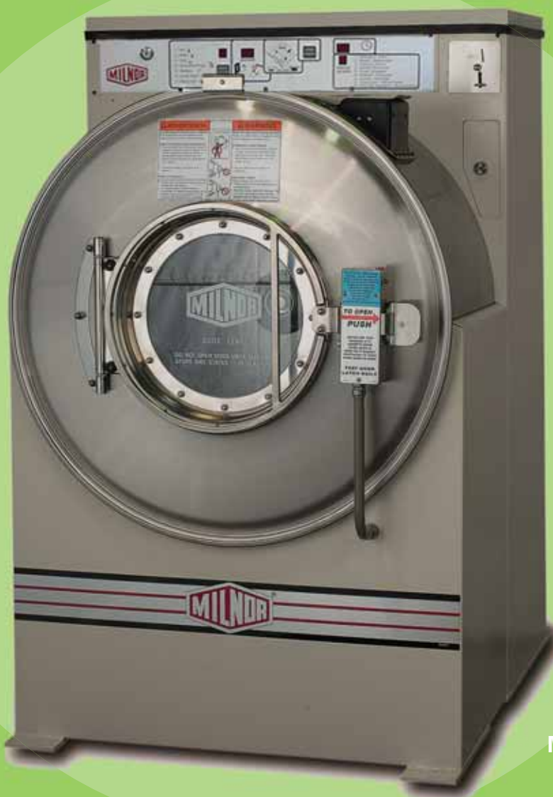
Model 30015 C4E

CLASSIC-STYLE WASHER-EXTRACTORS • LARGER CAPACITIES FOR HIGHER PROFITS