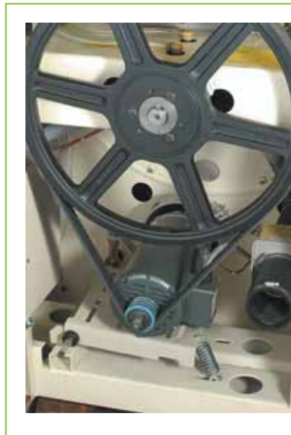
Simple, streamlined design.

Shell and washing cylinder are made of stainless steel to resist corrosion. Base and shell back have two coats of durable epoxy paint baked on. Epoxy coating provides a long lasting, impervious finish. (Warm grey color is standard, almond and white colors are optional.)