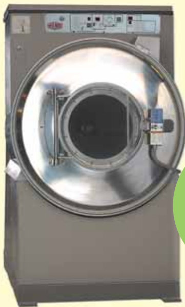
36021 C4E SuperLoader 80 lbs. (36 kg)